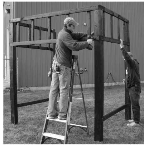
Step 2 Attaching the Assemblies