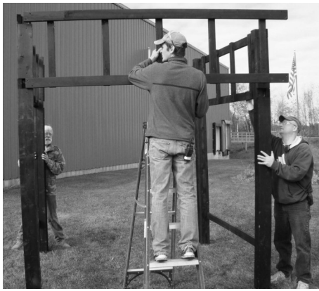
Step 2 Setting Up the Unit