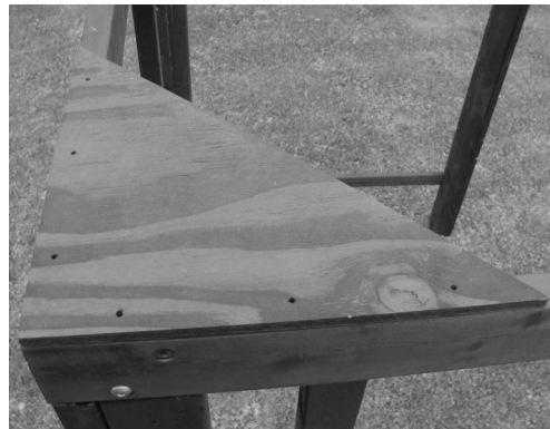
Step 3 Attach the Corner Gussets